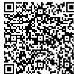
Online Giving Link