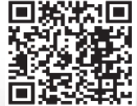
Financial Peace University

For registration and more information, please go to www.funceules.org or follow the QR codes.