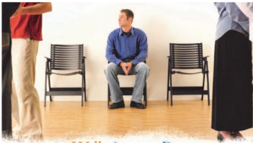
Just Walk Across the Room

Just Walk Across the Room is a 5 week small group study offering a fresh, personal approach to evangelism. It provides simple, practical steps that all can do to help